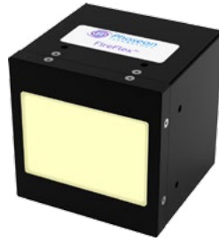
Phoseon FireFlex™ UV LED Curing Light Source