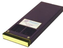
FireEdge UV LED Curing Light Source