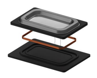
Figure 3: Basis of a speaker

The basis of a speaker is the diaphragm (typically made from mylar, paper, or metal) that vibrates when electronic current is applied. This current is provided with wires (sometimes called a spider or coil) attached to a source that has converted digital signals into analog signals for pushing out over the airwaves. Holding it all together is a frame that is used to adhere the speaker to the electronic device. Figure 3 shows this basic structure.